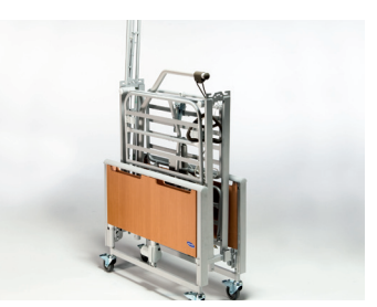
Easy to store and to transport when placed on the transport kit.